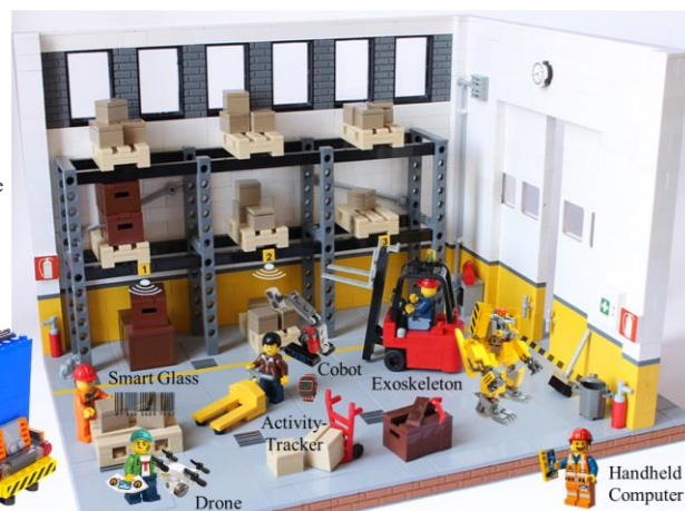
Fig. 1. Overview – Logistics Operator 4.0: External Logistics